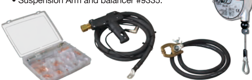
*Please call or visit our website www.cebotechusa.com for approval updates.