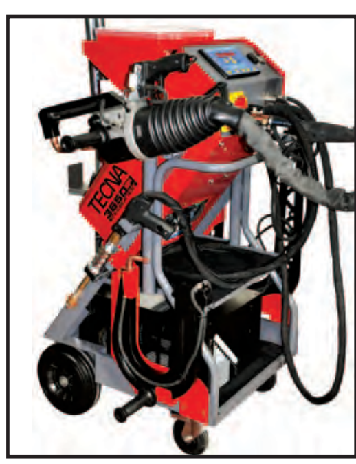
*Please call or visit our website at www.cebotechusa.com for current OEM approvals, updates and/or changes.